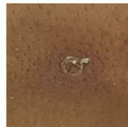
f) partially removed scab