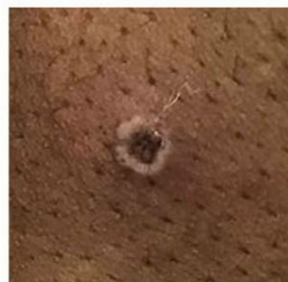
d) ulcerated lesion, 5mm diameter