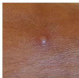
a) early vesicle, 3mm diameter

Student Confidentiality is imperative. No Student should be identified as having MPV