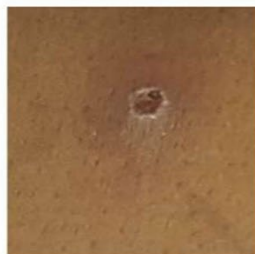
e) crusting of a mature lesion