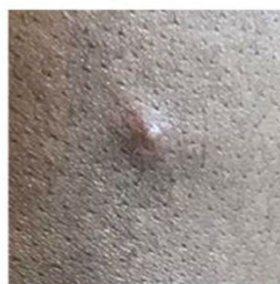
b) small pustule, 2mm diameter