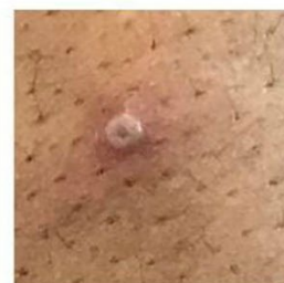
c) umbilicated pustule, 3-4mm diameter